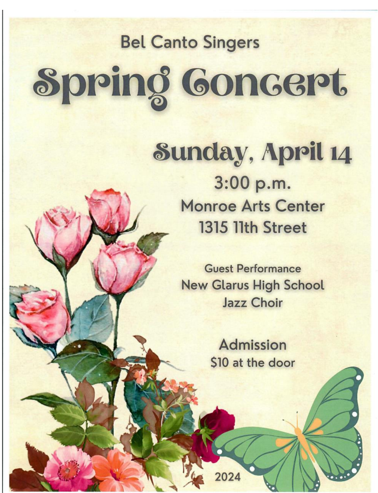
Kiwanis. We sing! You are invited to enjoy this concert which includes many singing Kiwanians