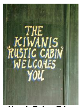
Kiwanis Youth Cabin, located on a 10-acre site on Youth Cabin Rd., has served children and adults with outdoor experiences since