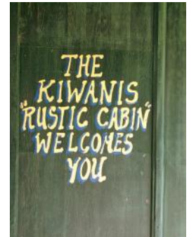
Kiwanis Youth Cabin, located on a 10-acre site on Youth Cabin Rd., has served children and adults with outdoor experiences since