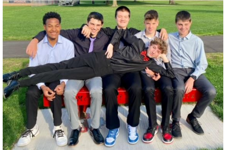
MHS sophomores preparing to eat anything that got in their way!