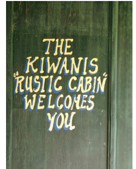
Kiwanis Youth Cabin, located on a 10-acre site on Youth Cabin Rd., has served children and adults with outdoor experiences since 1954.

To contact Secretary Beth Kindschi: 608.325.5658 or kindschi@tds.net