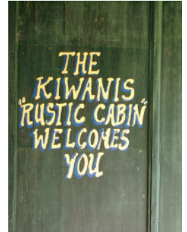
Kiwanis Youth Cabin, located on a 10-acre site on Youth Cabin Rd., has served children and adults with outdoor experiences since 1954.

To contact Secretary Beth Kindschi: 608.325.5658 or kindschi@tds.net