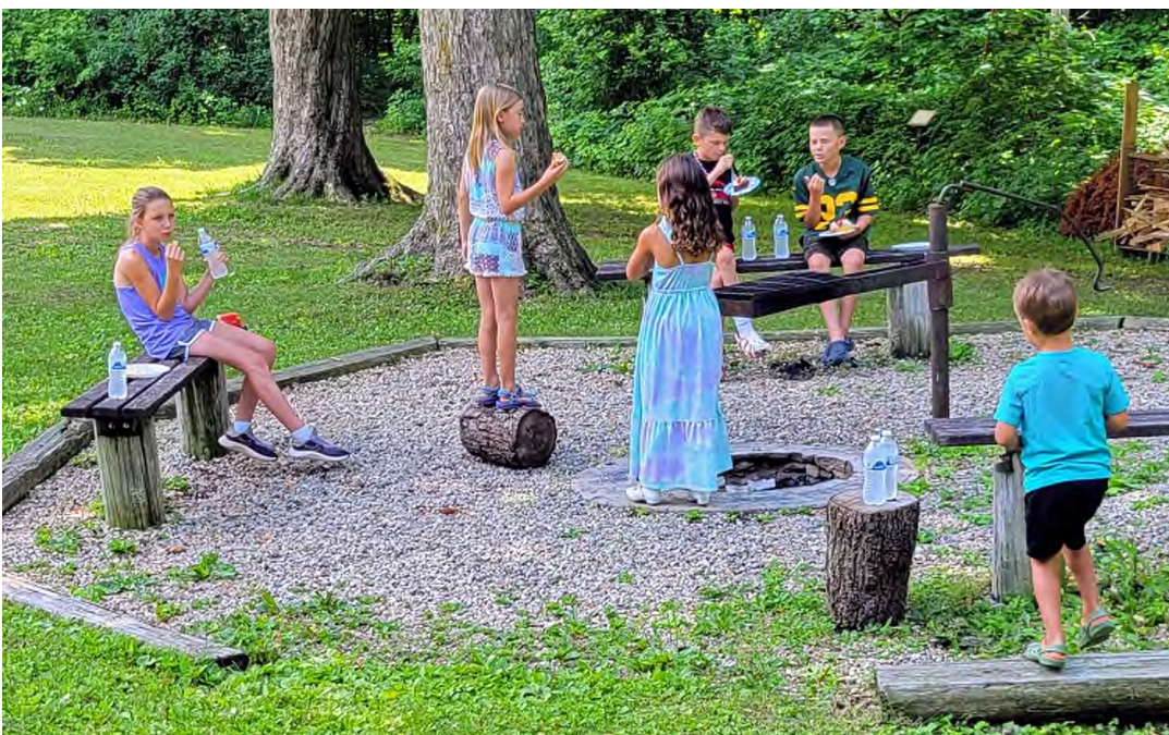
At a recent meeting at the Youth Cabin, we were joined by a passel of future Kiwanians!