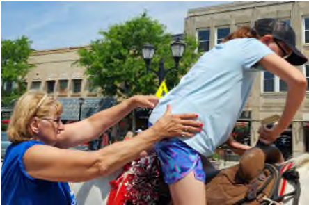
Kiwanis again sponsored pony rides in conjunction with Main Street opening event. Of course it was a hit with the young crowd.