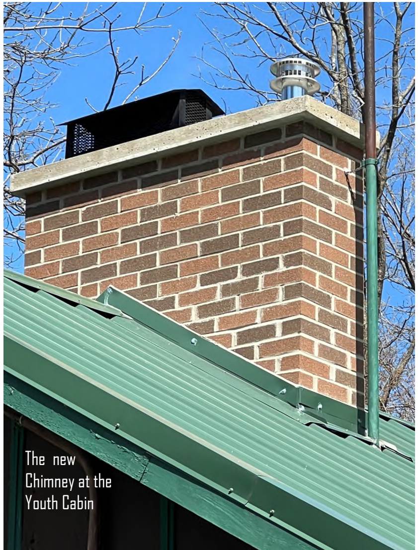
The new Chimney at the Youth Cabin