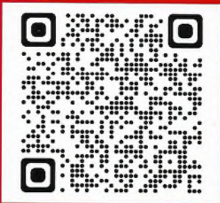
FAMILY PROMISE WEBSITE

1 IN 30 YOUTH AGES 13-17 EXPERIENCES HOMELESSNESS OVER A 12 MONTH PERIOD