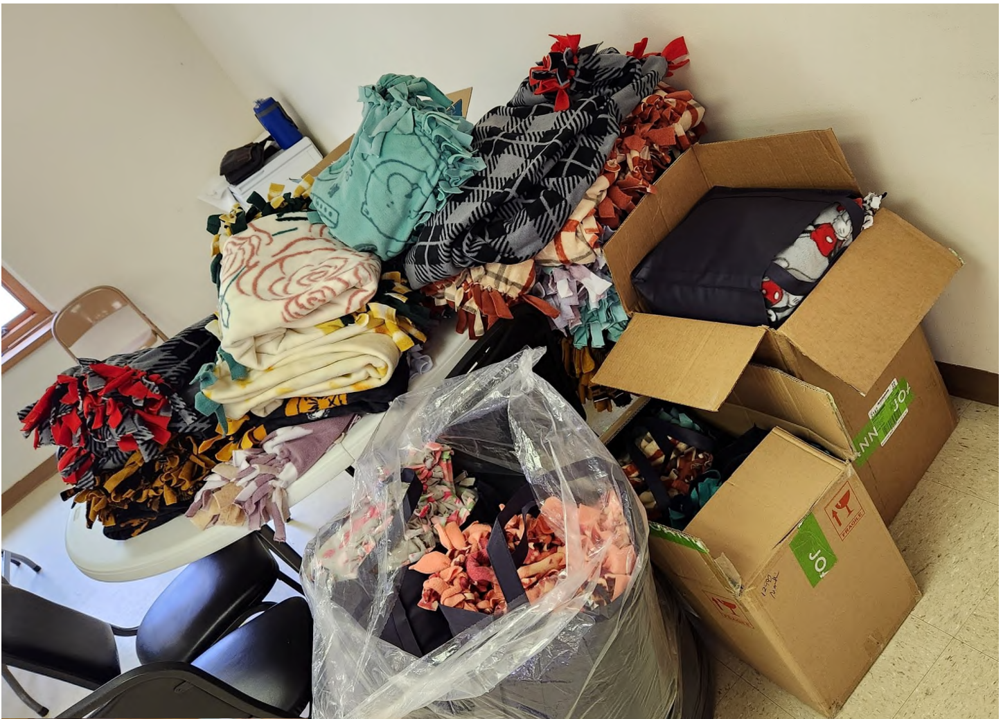
Results of the effort shown above