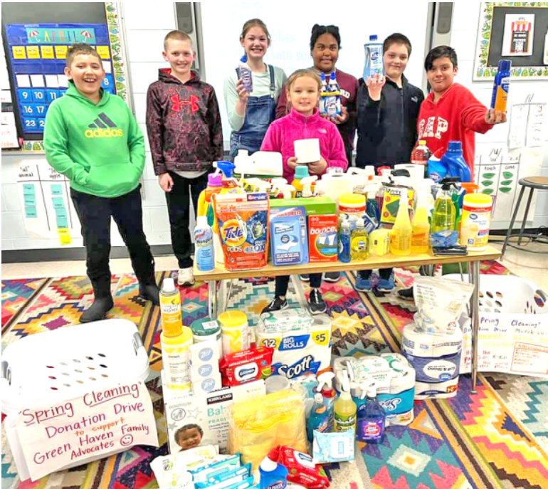
Below: Northside K Kids have a great time working on a project