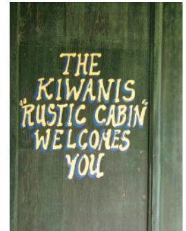
Kiwanis Youth Cabin, located on a 10-acre site on Youth Cabin Rd., has served children and adults with outdoor experiences since 1954.

To contact Secretary Beth Kindschi: 608.325.5658 or kindschi@tds.net