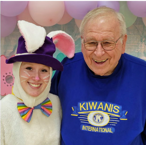
Kiwanis/Park & Rec Easter Egg Hunt