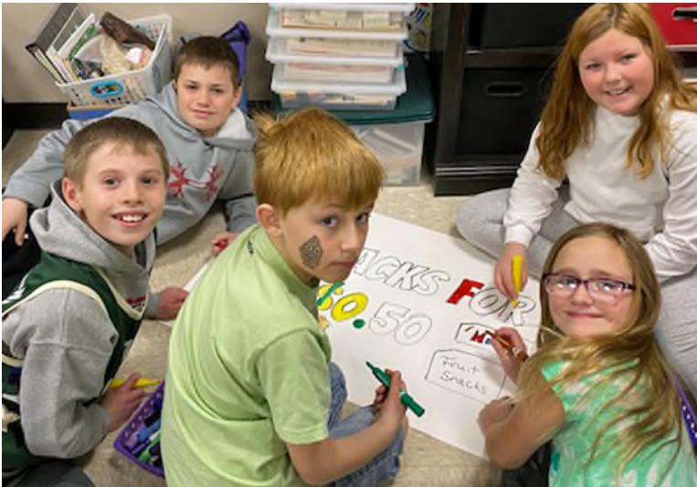
K Kids prep for movie night, above and right