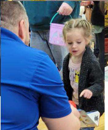
Easter Hunt photos