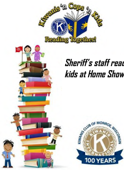
Sheriff's staff read to kids at Home Show